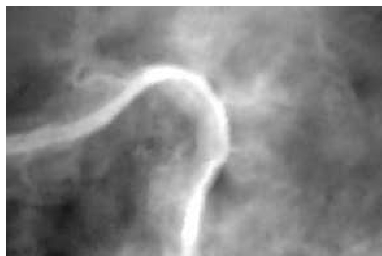
(a) Training Image