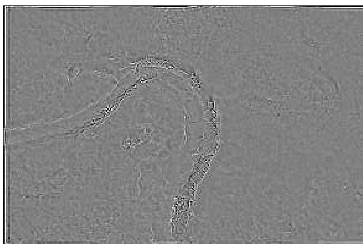
(b) Training Image * PEF